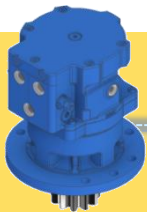
Swing Unit -SG02G-